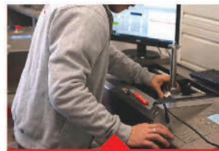
Test P10 P11 P12 according to DESP

In order to maintain the high level of industrial and environmental requirements expected by our customers, we are constantly investing in our production tool :