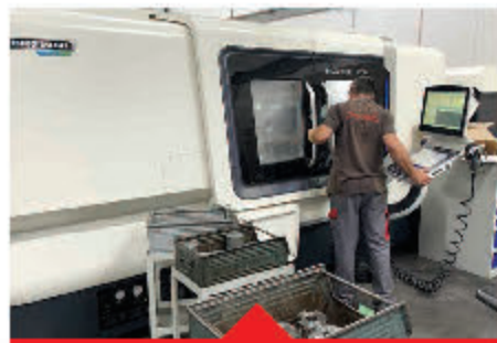
Constant investment in machines

With a machining hall of 1,000 m 2 , an assembly and test workshop of 1,500 m 2 and more than 2,000 m 2 of storage, Meca-Inox has an optimal industrial tool closed to its markets.